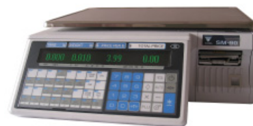
SM-90N - Numeric Display SM-90EB - Sequential Alpha-Numeric Display