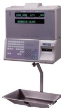
SM-90H - Simultaneous Alpha-Numeric Display