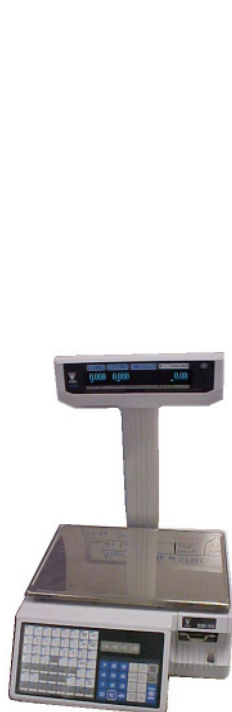
SM-90EP - Sequential Alpha-Numeric Post Display