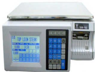
SM-90TB- Touch Screen