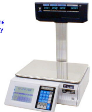
SM-90TP- Touch Screen with Post